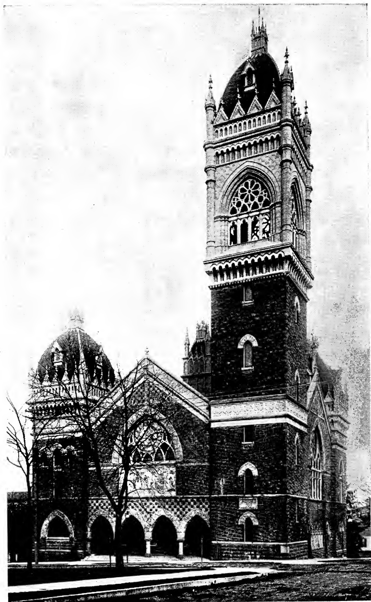
CHURCH EDIFICE IN PORTLAND, DEDICATED IN 1895